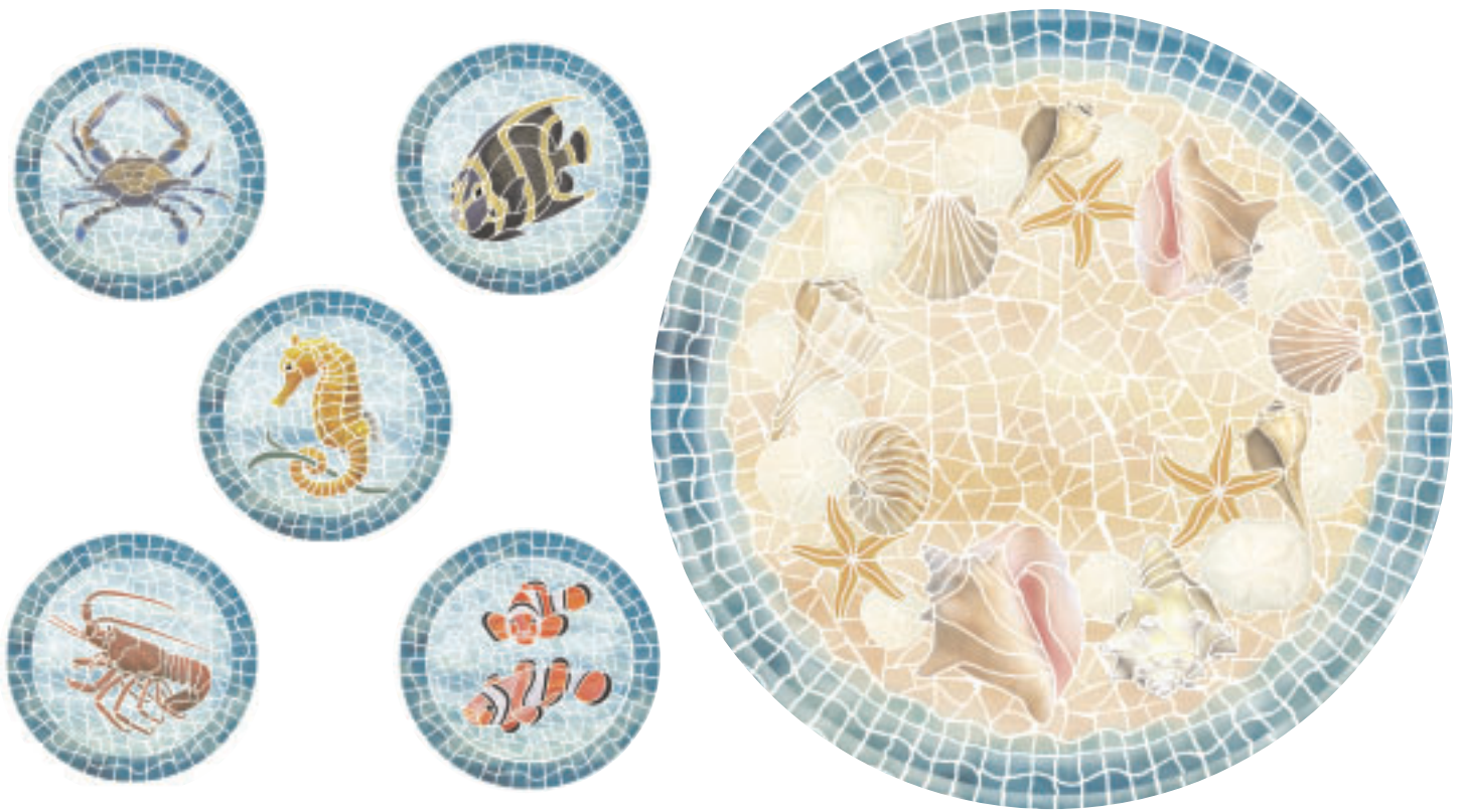
Above: custom table and seat designs presented to customer for pool area. Below: finished product.